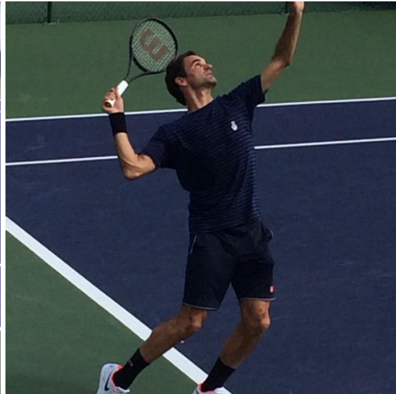
Roger Federer during a practice session