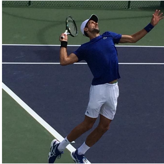
Novak Djokovic during a practice session